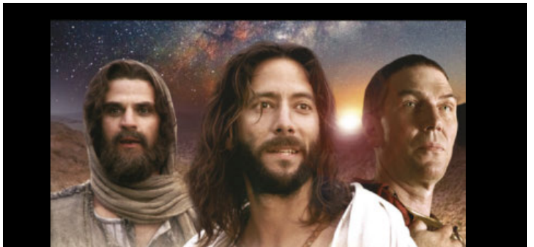
The Gospel of John, written by JOHN, SON OF ZEBEDEE