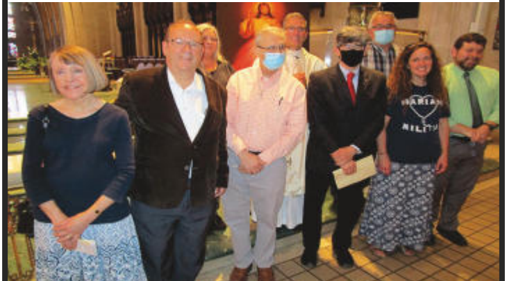
Members of the Go to Joseph Now! Prayer Group had their Consecration Ceremony after the 10:00 am Mass on Sunday, May 2nd.