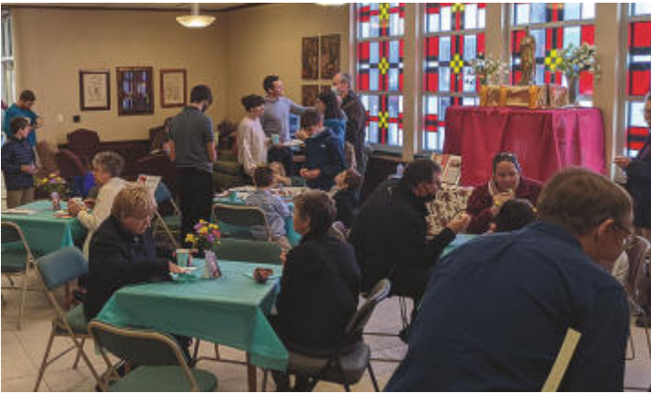
Parishioners enjoy food blessed at the St. Joseph Table -- a time honored Italian tradition, but one we proudly make our own here at St. Joseph's Cathedral!