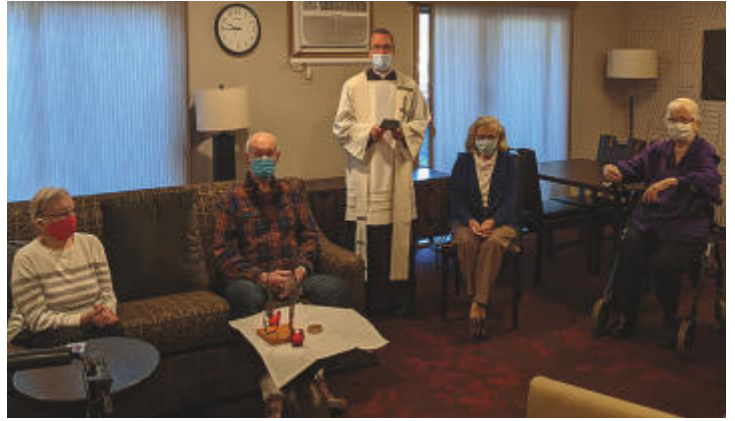
Sunday morning Holy Communion Service at Washburn Place. If you know of anyone who desires a visit, please do let us know!