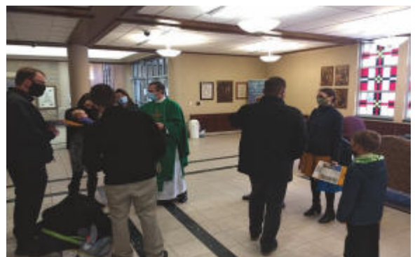
Mingling after Mass. It's the place to be!