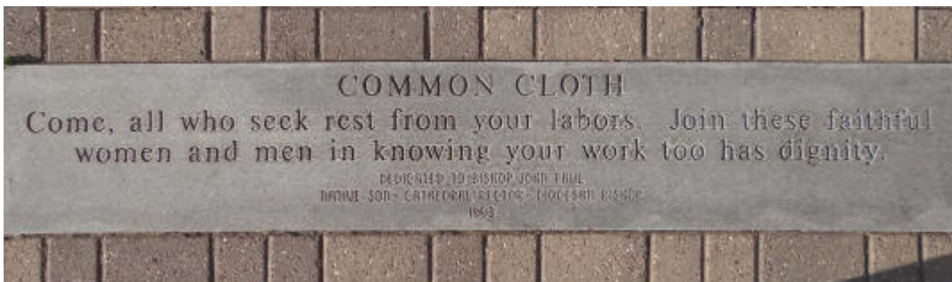
Left: This inscription lies at the foot of the sculpture

In 1955, Pope Pius XII instituted the Feast of St. Joseph the Workman to be celebrated on May 1. This date was chosen to honor St. Joseph to restore the dignity to the worker and his labor. In the Communist bloc countries, May 1 was a holiday in which product was hailed as supreme and the worker regarded only of importance in output. Even though this feast has changed to an optional memorial, the devotion to St. Joseph under this title has not.