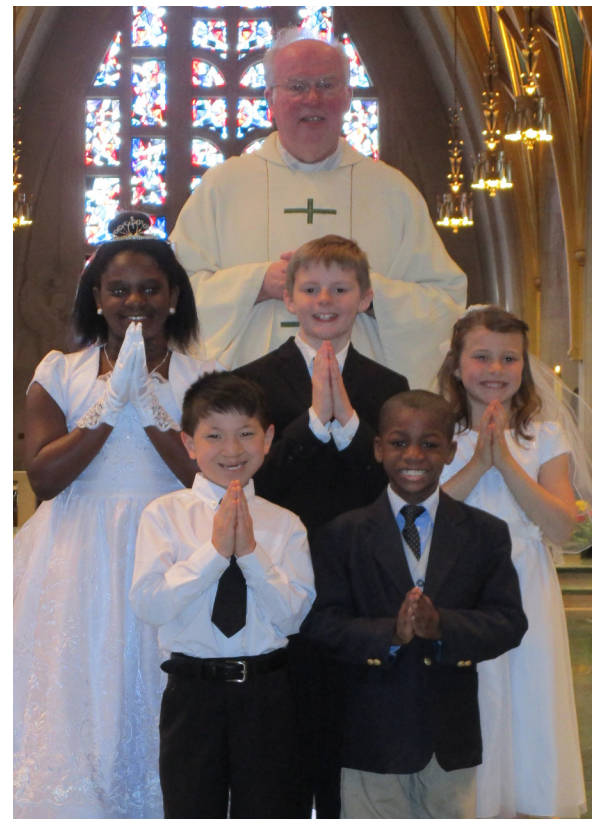
Five Cathedral parishioners received First Communion at the 10:30 a.m. Mass on April 22. They are: